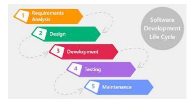
Fig: 3 SDLC Model

There are numerous shots of SDLC models and each of these models makes utilization of testing stage. Consequently, this makes testing a critical part in any product advancement life cycle. With unit testing, reconciliation tests, framework testing, relapse tests and client acknowledgment testing and significant sorts of testing, causes any designer to concoct a solid and trusted web application that can be valuable. Testing additionally takes after its own particular lifestyle like test examination, test design, test outline and test execution.